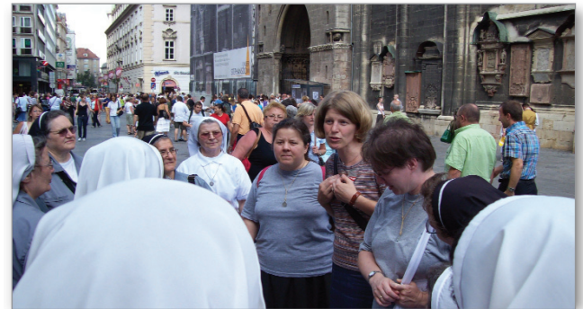
A group of Sisters visiting Vienna were welcomed and accompanied by the Sisters of Region Austria.