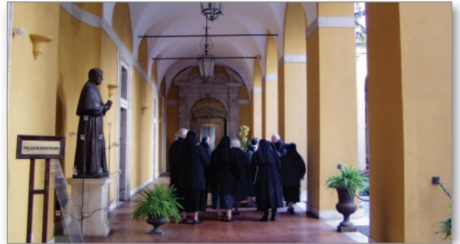
February 16, 2008. Visit to Fr. Jordan's grave at Curia Generalizia of the Salvatorians, Rome.

congregation; the joy of belonging to a small, but, lively congregation is a seed of hope for the future.