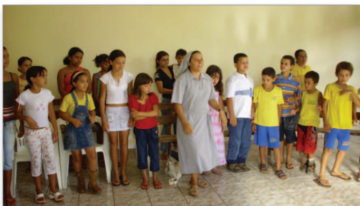
Celebration with the children.