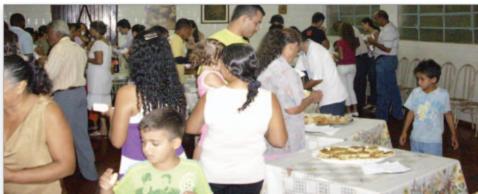
Sharing a festive meal after the liturgy in Goiania on March 9, 2008