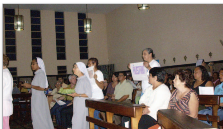
Presentation of international symbols during the offertory procession at liturgy on March 9th.