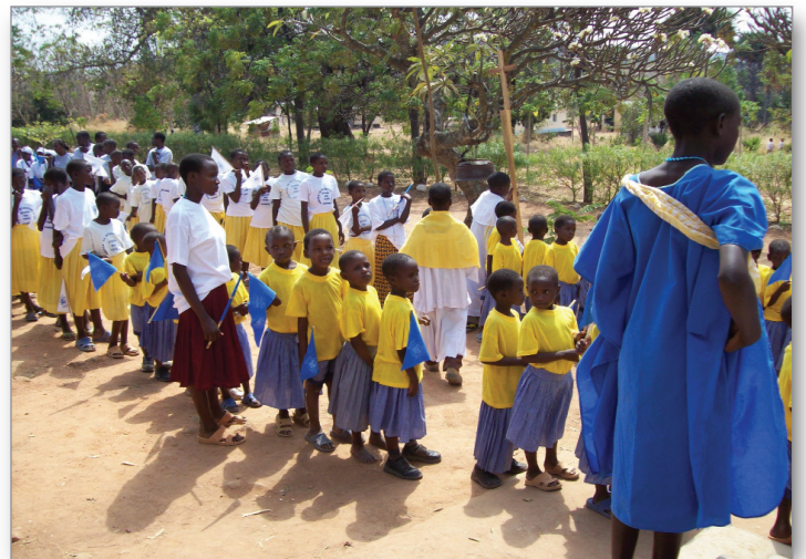
Procession from the parish to the house of the sisters.