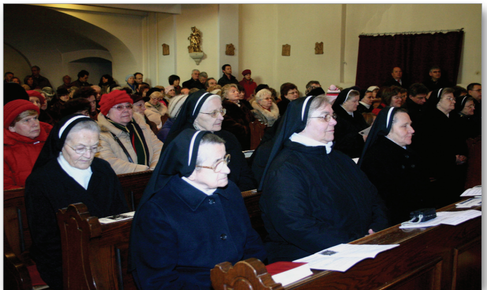
Opening liturgy at St. Lawrence Parish in Altsimmering.