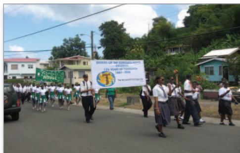
Students from St. Rose Modern Secondary School, Grenada, march through town with a 125th Anniversary sign before competition begins at the Mini-Olympic games.