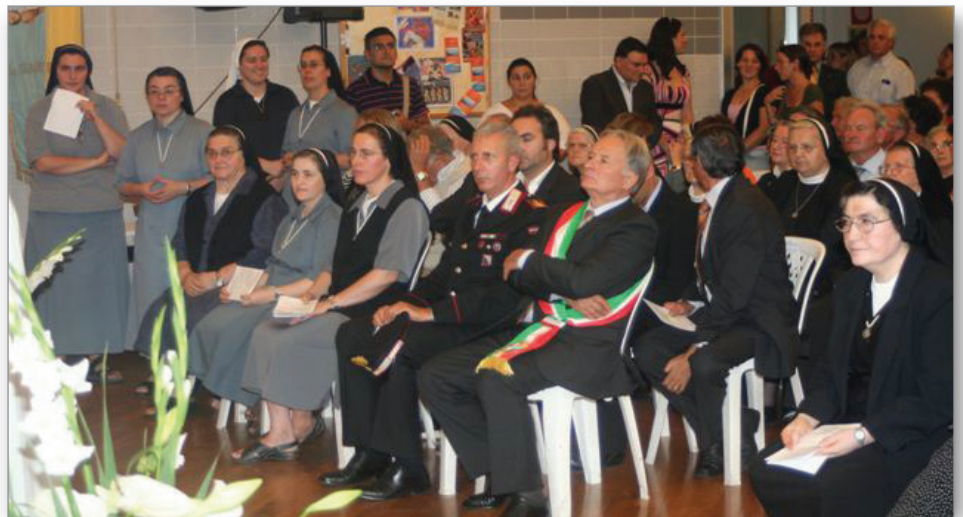
The regional celebration of the 125th Anniversary on September 14 with the participation of friends, acquaintances, families, civil and religious authorities.