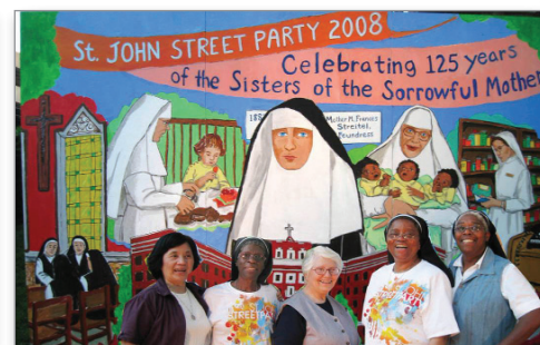
Sisters attend the annual "Street Party" by St. John Health System, Tulsa, where the sisters' history and 125th Anniversary Celebration is acknowledged in pictures/posters.