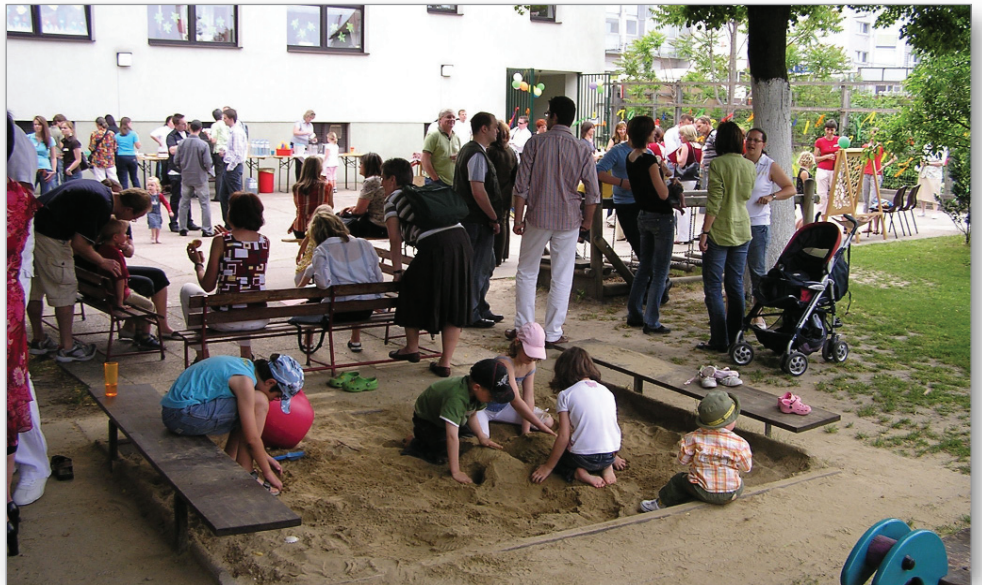
Guests enjoying the gathering at the location of the former kindergarten.