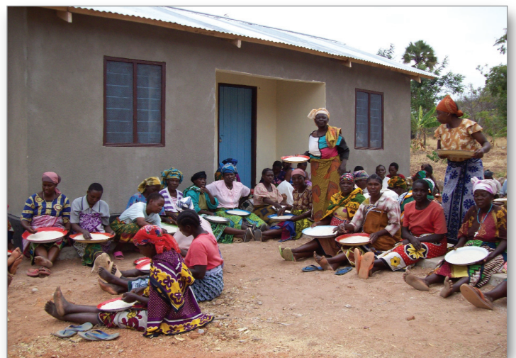
The women of Ifunde prepared the dinner for the guests of the Jubilee Celebration which was celebrated on August 6, in Ifunde.